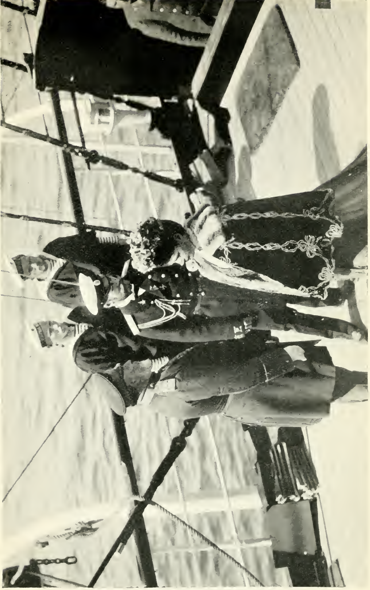
King Edward VII., the Emperor, and the Dowager Empress.